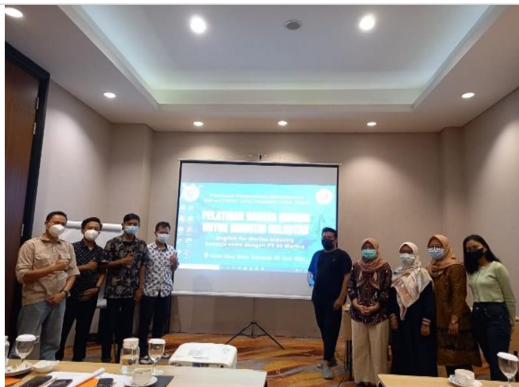
Picture 4. Photo Session with the Community Service Team and Participants