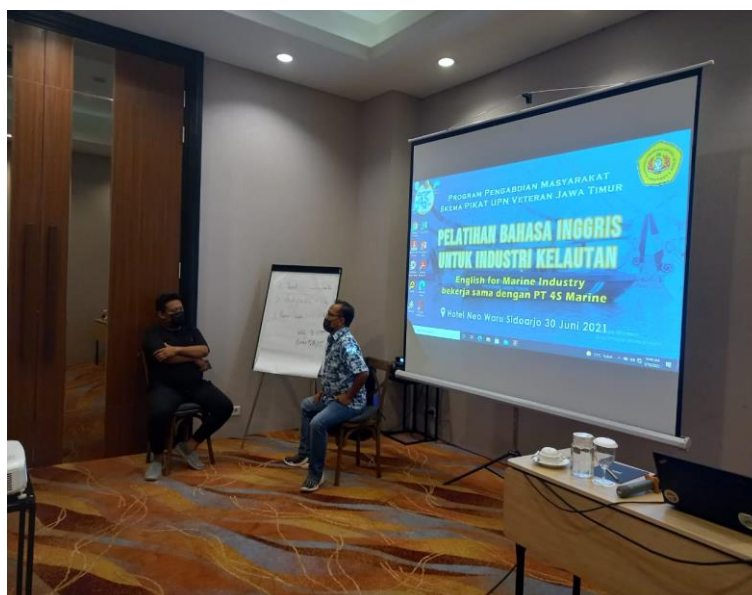
Picture 2. Conversation Practice by the Participants

Meanwhile, the participants are familiar with the document. It is just that so far, the participants have accessed it in Indonesian because the marketing of speedboat products produced by the company is still limited to domestic markets. Thus, the participants were not used to the documents in English.